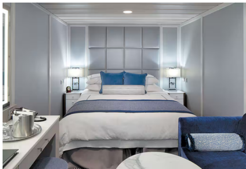
INSIDE STATEROOM CATEGORY F | G

670 GUESTS | 400 CREW | 373 SUITES | 10 DECKS | 593.7 LENGTH | 31M WIDTH | 30,227 TONNAGE