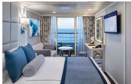
VERANDA STATEROOM CATEGORY B1 | B2 216 SQ FT including balcony