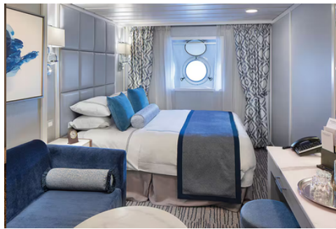
OCEAN VIEW CATEGORY D 143-165 SQ FT including balcony