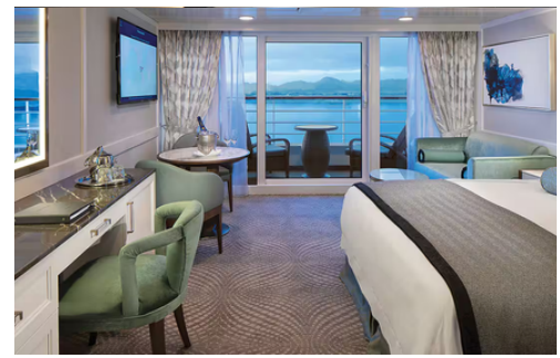
PENTHOUSE SUITE CATEGORY PH1|PH2| PH3 322 SQ FT including balcony