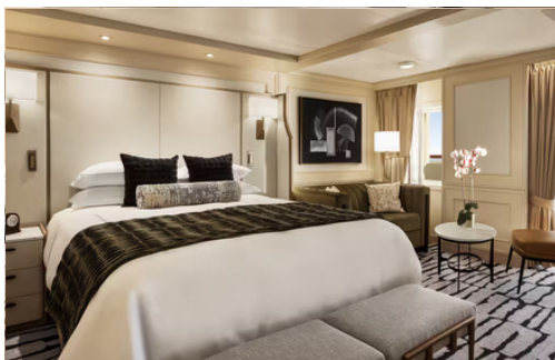
PENTHOUSE SUITE CATEGORY PH1|PH2|PH3 440 SQ FT including balcony