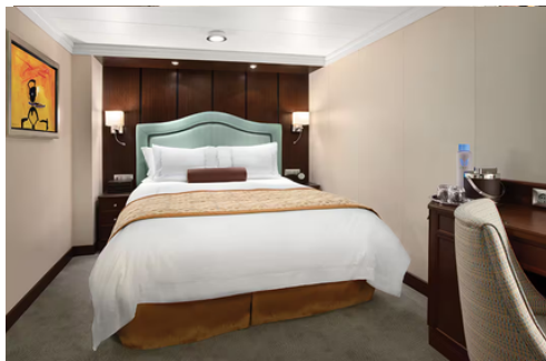
INSIDE STATEROOM CATEGORY FIG 174 SQ FT

1,250 GUESTS | 800 CREW | 62 SUITES | 15 DECKS | 785 LENGTH | 106M WIDTH | 66,084 TONNAGE