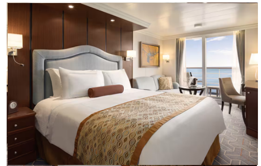
CONCIERGELEVEL VERANDA CATEGORY A1|A2|A3|A4 291 SQ FT including balcony