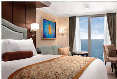
DELUXE OCEANVIEW CATEGORY C 240 SQ FT including balcony