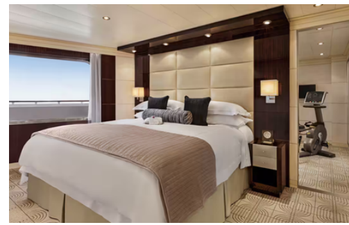
VISTA SUITE CATEGORY VS 1,200-1,500 SQ FT including balcony