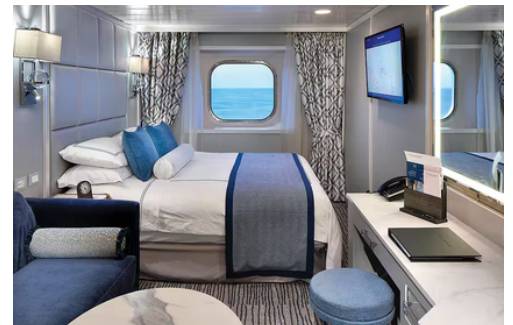
DELUXE OCEAN VIEW CATEGORY CI|C2 165 SQ FT including balcony