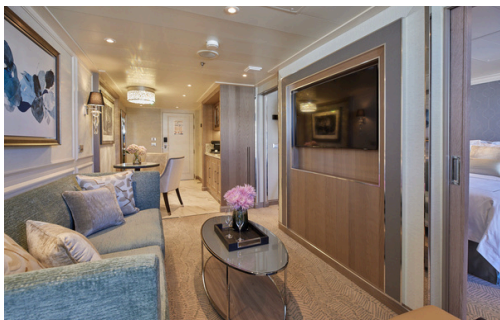
PENTHOUSE SUITE CATEGORY 52 - 60m 2 including balcony A - C