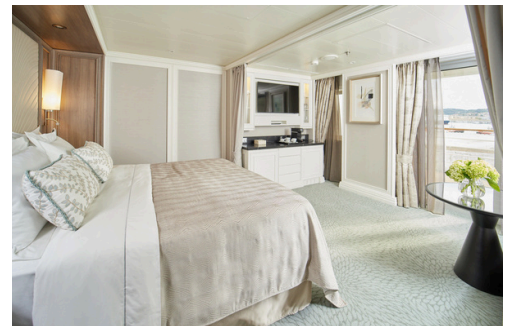
CONCIERGE SUITE CATEGORY 39 - 43m 2 including balcony D & E