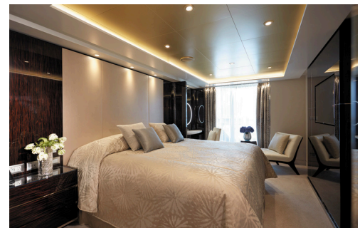
GRANDEUR SUITE CATEGORY 76 - 85m 2 including balcony GN