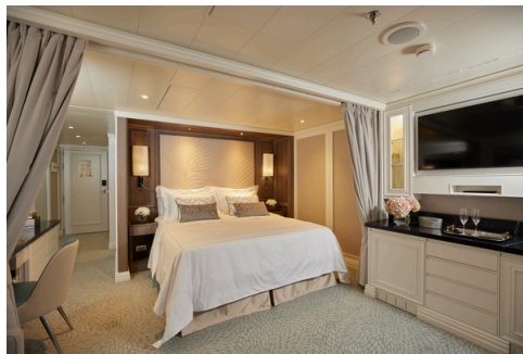
SERENITY SUITE CATEGORY 39 - 43m 2 including balcony F1 & F2