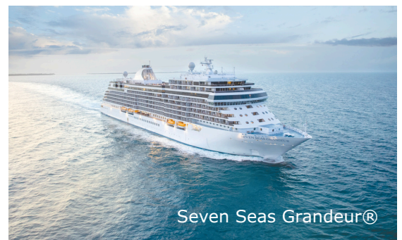
Seven Seas Grandeur®