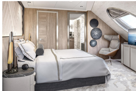
SEVEN SEAS SUITE CATEGORY 76m 2 including balcony SS