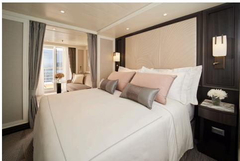
VERENDA SUITE CATEGORY 28m 2 H

744 GUESTS | 548 CREW | 372 SUITES | 10 DECKS | 224M LENGTH | 31M WIDTH | 55,500 TONNAGE | BUILT 2023