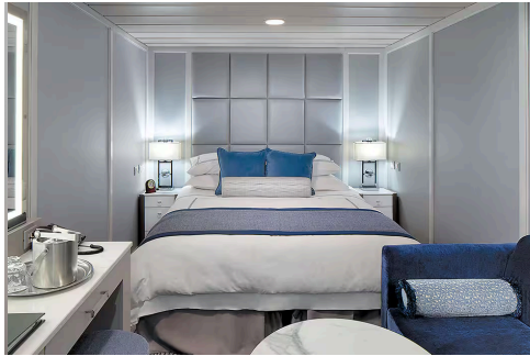
INSIDE STATEROOM CATEGORY F | G 160 SQ FT

670 GUESTS | 400 CREW | 333 SUITES | 10 DECKS | 593.7 LENGTH | 31M WIDTH | 30,227 TONNAGE