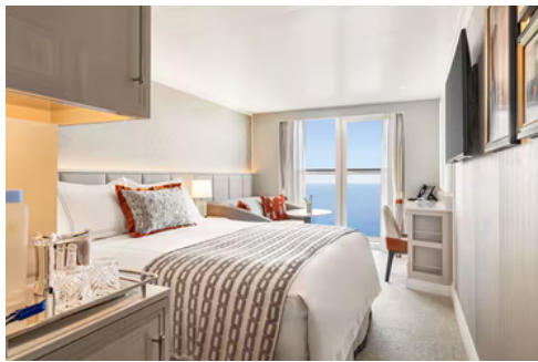
FRENCH VERANDA CATEGORY B5 240 SQ FT

1,200 GUESTS | 800 CREW | 147 SUITES | 16 DECKS | 241 LENGTH | 32M WIDTH | 67,000 TONNAGE