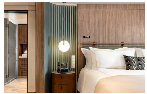
VISTA SUITE CATEGORY VS 1,450-1,850 SQ FT including balcony