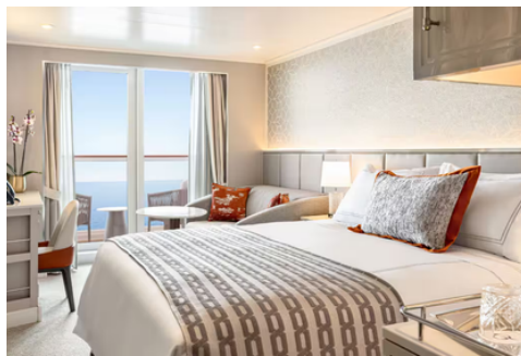
VERANDA STATEROOM CATEGORY B1|B2|B3|B4 291 SQ FT including balcony