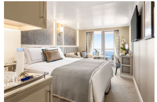
CONCIERGE LEVEL VERANDA CATEGORY A1|A2|A3|A4 291 SQ FT including balcony