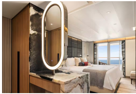
OCEANIA SUITE CATEGORY OC 1,000-1,200 SQ FT including balcony