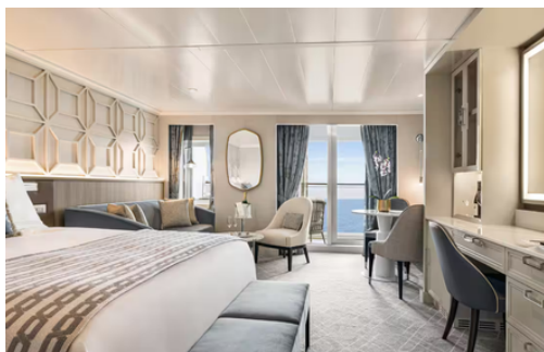
PENTHOUSE SUITE CATEGORY PH1|PH2|PH3 440 SQ FT including balcony