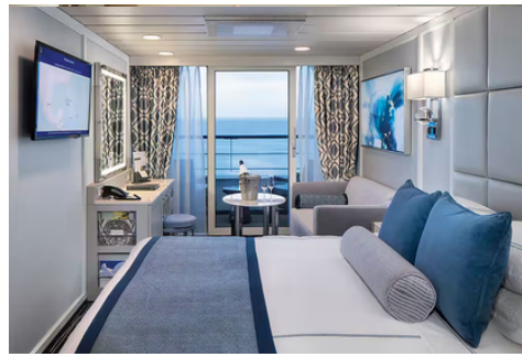
CONCIERGE LEVEL VERANDA CATEGORY A1 | A2 | A3 76m 2 including balcony